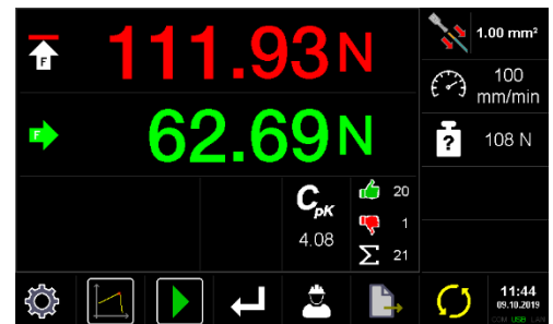
Measurement results on the touch screen