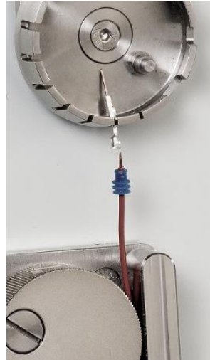
Clamping crown (standard)